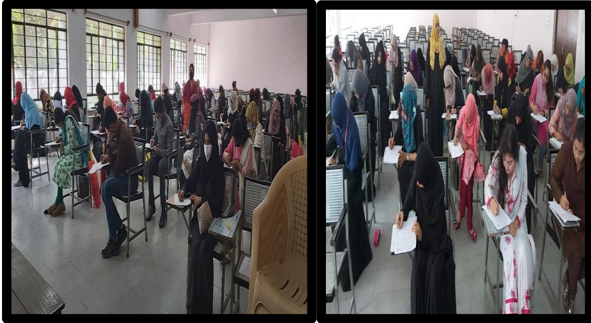
Student taking internal assessments

Students develop accountability and self-discipline to upgrade their skills