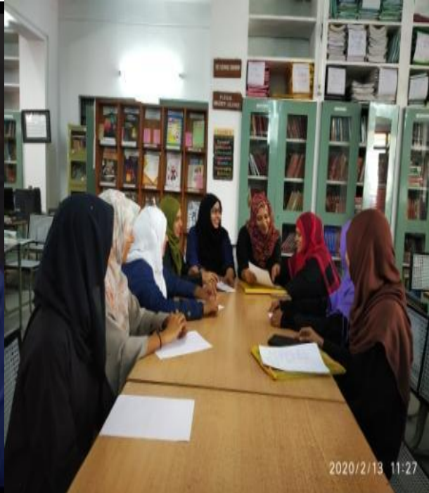
Subject content discussions with faculty