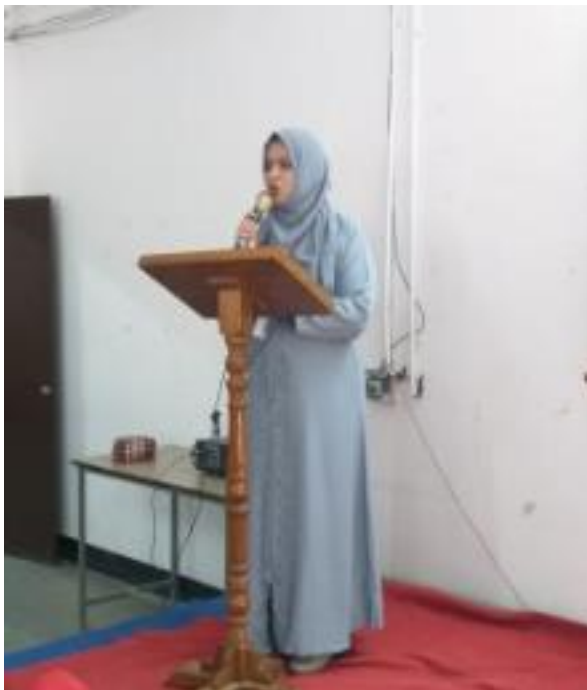
Extempore - 'An exciting day in my life'