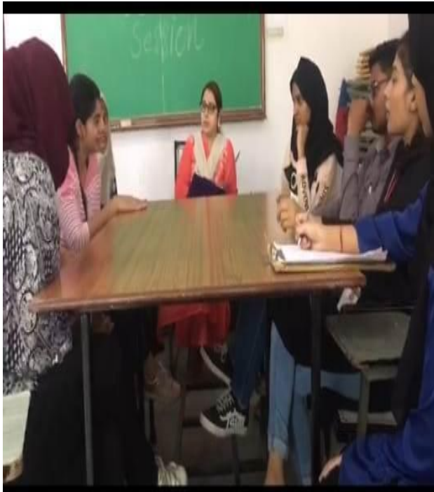
Debate - 'Dress code for Teachers'

Accredited by NAAC; Affiliated to Osmania University