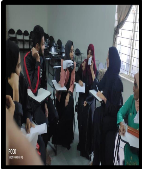
Peer tutoring using interactive discussion