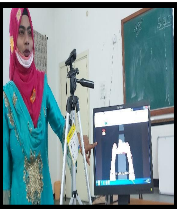
Peer tutoring - using ICT