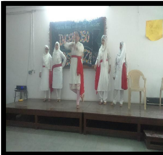
Peer tutoring - integrating dance