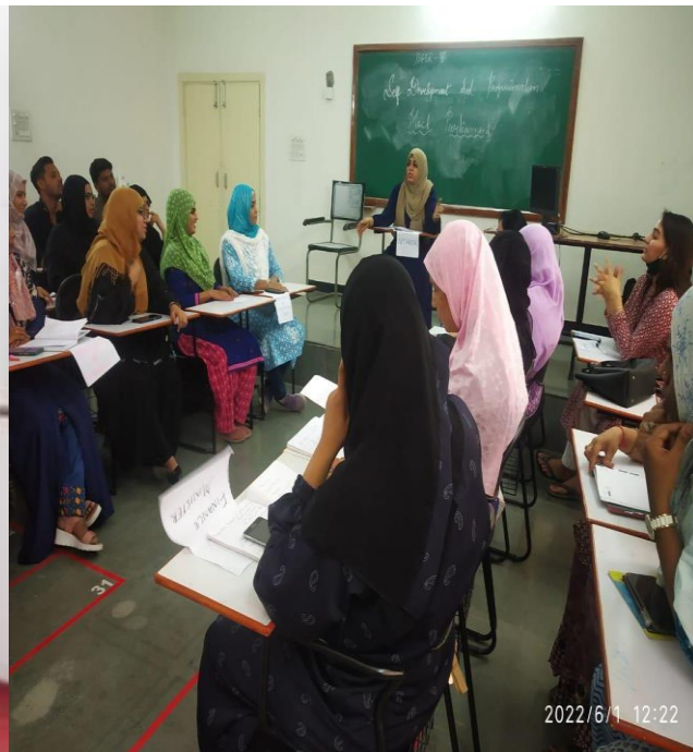
Mock Parliament - M.Ed. (2021-23)