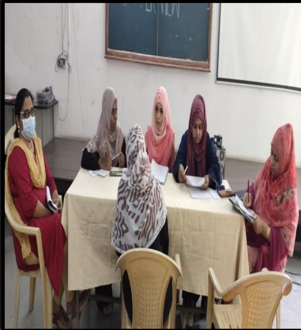
Mock Interviews to prepare the students